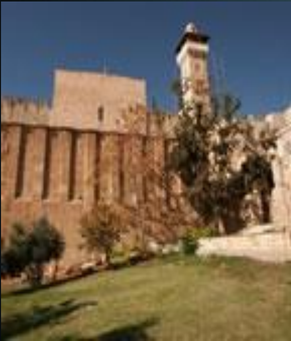
Modern day site